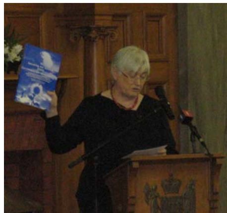
Hon Marian Hobbs at the New Zealand parliament launch of Securing our Survival

One of the questions however, is whether a Nuclear Weapons Convention is practically achievable or merely a utopian dream. To answer that question, the Lawyers' Committee on Nuclear Policy in 1997 brought together a group of lawyers, scientists, diplomats and disarmament experts to attempt to draft a Model Nuclear Weapons Convention taking into consideration the legal, technical and political elements required to achieve a nuclear weapons free world. Nine months later, their product was circulated by the United Nations as UN Doc A/C.1/52/7. An updated Model NWC was submitted to the 2007 Conference of States Parties to the Non-Proliferation Treaty and 62 nd United Nations General Assembly (UN Doc A/62/650), and published in the book Securing our Survival: The Case for a Nuclear Weapons Convention .